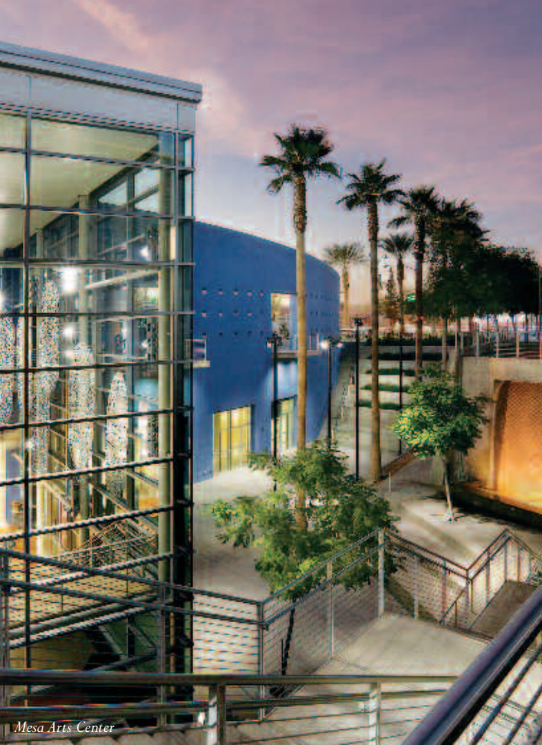
Mesa Arts Center