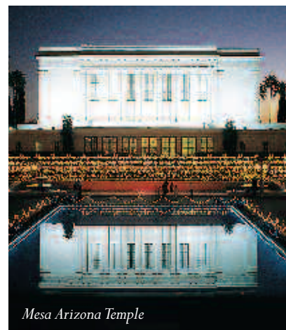
Mesa Arizona Temple

Tortilla Flat, an authentic Old Stagecoach Stop along the scenic Apache Trail, is one of the last remnants of the Old West. Stroll up and down the boardwalk, where the clomp of shoes on the wood is reminiscent of a time past, when wooden sidewalks were the only kind of sidewalk. www.tortillaflataz.com